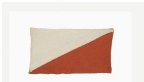
Colour patch : 4 Australian Light Horse Regiment, AIF

“B” Squadron 4 th LHR was the first Australian Light Horse unit to go to France. Arriving at Marseilles on 27 Mar 1916. A fact which amounts to another “FIRST” for the 4 th LHR, as after Gallipoli, “B” Squadron is the first sub-unit of the AIF to reach Europe. Upon arrival in France, horses and men endured a five mile march to a rest camp, followed the next day by a 58 hour train journey, then off the train for a