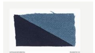
Colour patch : 4 Light Horse Regiment, AIF

seven mile march to their billets in Strazeele where they stayed until April 23, the day they moved to Sercus. There they awaited the arrival of “D” Squadron, who had to undergo a similar journey of ships, train trips and miles of long marches leading their horses.